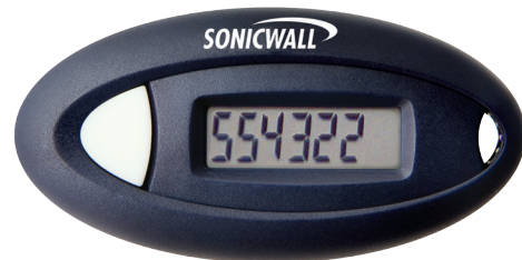
DIGIPASS BY VASCO